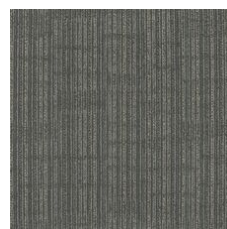
Sea Glass 62560